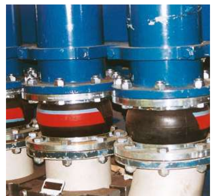
STENFLEX® type AS-1 used in cooling water system of ship's engine