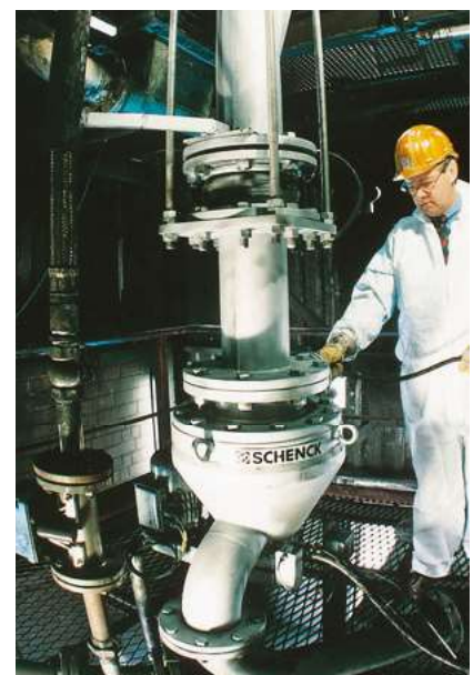
STENFLEX® type R-1 in a proportioning system